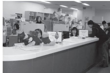
The Academic Advising Center on the first floor of Azabu Hall is now more spacious and accessible.

has concluded an agreement that allows it to use space at Fukuoka Jogakuin's Tenjin satellite campus for classes, weekend seminars, and events. The new facility promises to bring a few key improvements to the center's program. One benefit is that the center will be able to host the distinguished lecture series, which previously was only possible at the Tokyo and Osaka centers. Another is that TESOL Fukuoka Center students will have access to Fukuoka Jogakuin's computer labs, enabling TUJ to offer computer-based courses there. TUJ and Fukuoka Jogakuin will have a cooperative relationship going forward, including sharing information on student recruiting.