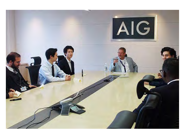
View from the Top Vol.2: TUJ students visit AIG & TESLA for "Boardroom Chat"