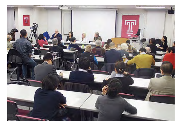
ICAS Book Talk Event Generates Lively Discussion on "Foreign Language Education in Japan"