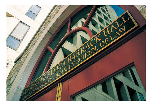
Temple Law Moves Into US News Top 50; Specialty Programs Climb As Well