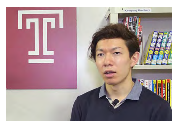
Learning the Responsibility of an Employee—Internship Experience at Audi Japan