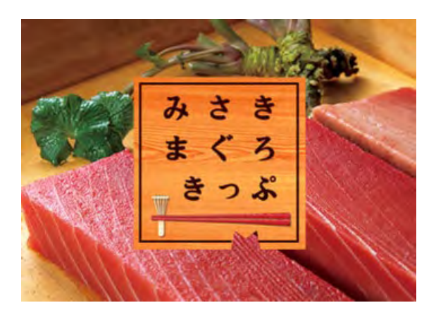
Day Trip to Misaki

Saturday, July 23 from 9:30 until evening