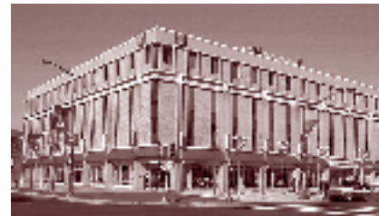
Vivaqua Hall is home to THM at the main campus.

TUJ welcomes another addition to its growing Undergraduate Program. Beginning summer 2004, TUJ will offer a Bachelor of Science in tourism and hospitality management (THM). Students will take two years of entry-level courses at TUJ before transferring to Temple University's main campus in Philadelphia for a final two years of upper-level curricula in the School of Tourism and Hospitality Management (STHM). TUJ's THM major responds to the current and prospective need for trained, globally responsive professionals in tourism and hospitality management.