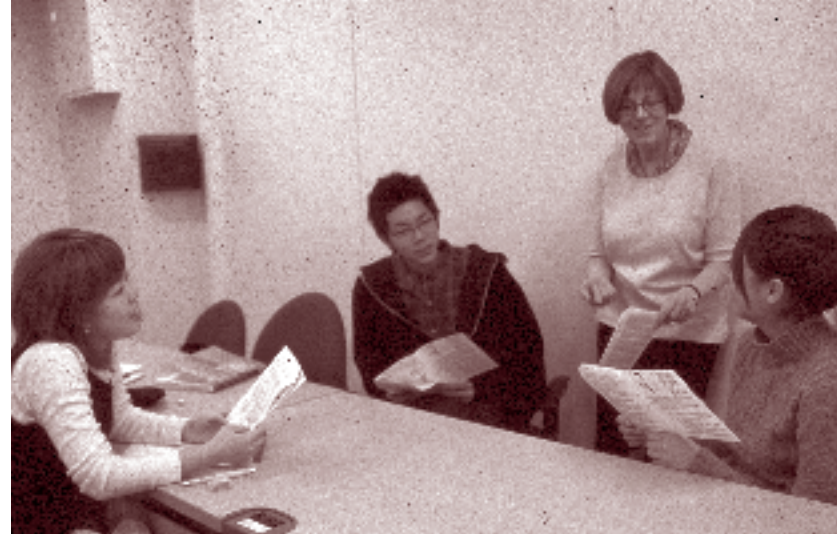
A recent survey indicates that more than 95% of APP students welcome the new curriculum.

each level comprises a more narrow range of English proficiency. Advanced MEd student interns under the close supervision of master teachers will teach about one-quarter of the 24 class hours. Qualified MEd students will also work as teaching assistants (TAs) in classes with master teachers as part of a practicum added to the MEd course lineup. It is anticipated that the TAs will learn a great deal by getting actual classroom experience under seasoned professionals, but it is also expected that the master teachers will benefit from mentoring their TAs. In addition, the APP plans to hire native English-speaking undergraduates from the College of Liberal Arts to assist in classes as teacher's aides, thereby raising