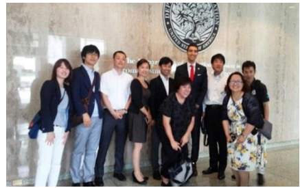
Participants at the U.S. Department of Education, D.C.

The participants then moved on to the U.S. where they spent four days at Temple University's main campus in Philadelphia attending lectures on U.S. administrative infrastructure and strategic planning, academic support initiatives, global partnership programs, international student services, faculty development and pedagogy, and risk management systems. Issues including study abroad, international admissions and research were also addressed in separate breakout sessions.